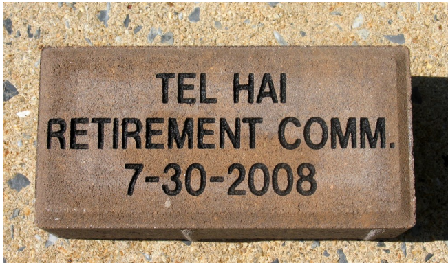
Shown above: sample color and font style of the Meadows Health Care Center bricks.

Would you like us to notify someone of this tribute?