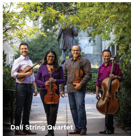
Dalí String Quartet